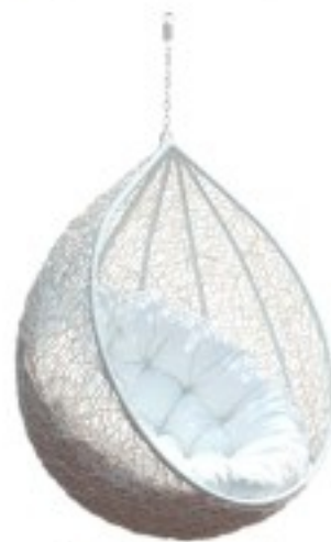
VC - 30