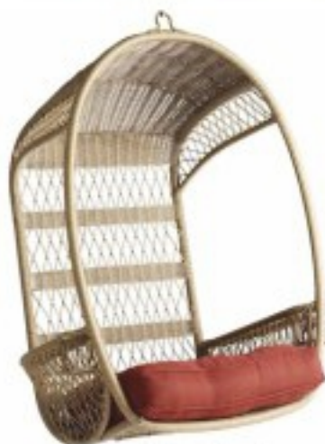
VC - 29