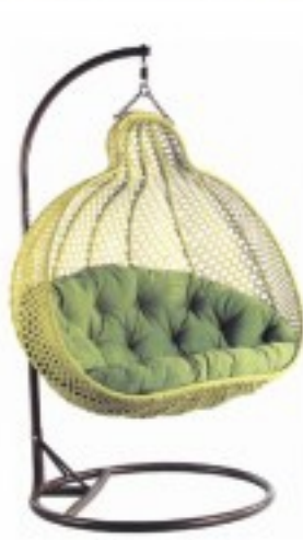
VC - 12