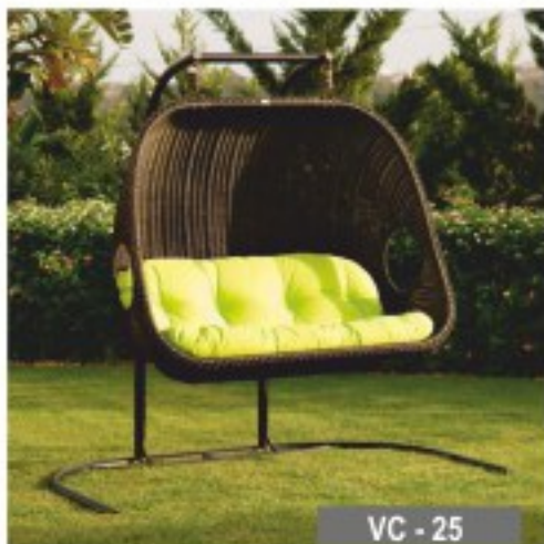
VC - 25