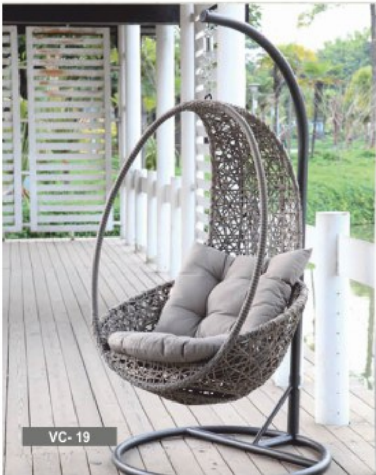
VC - 19