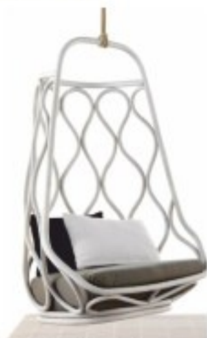
VC - 28