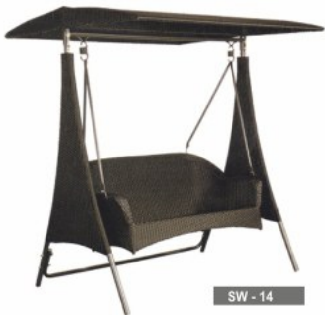
SW - 14