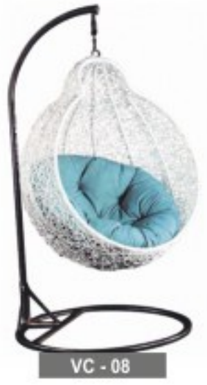
VC - 08