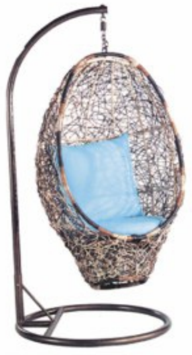
VC - 11