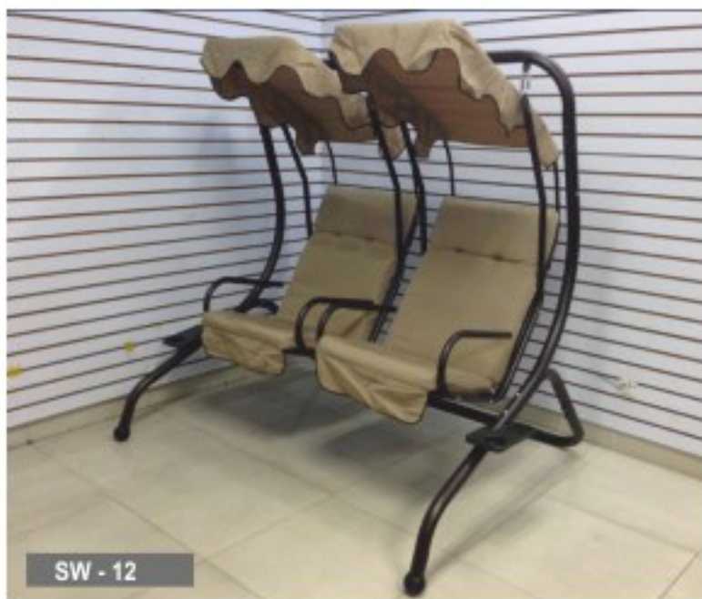
SW - 12