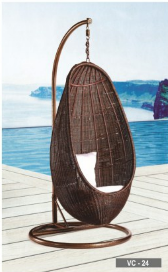
VC - 24