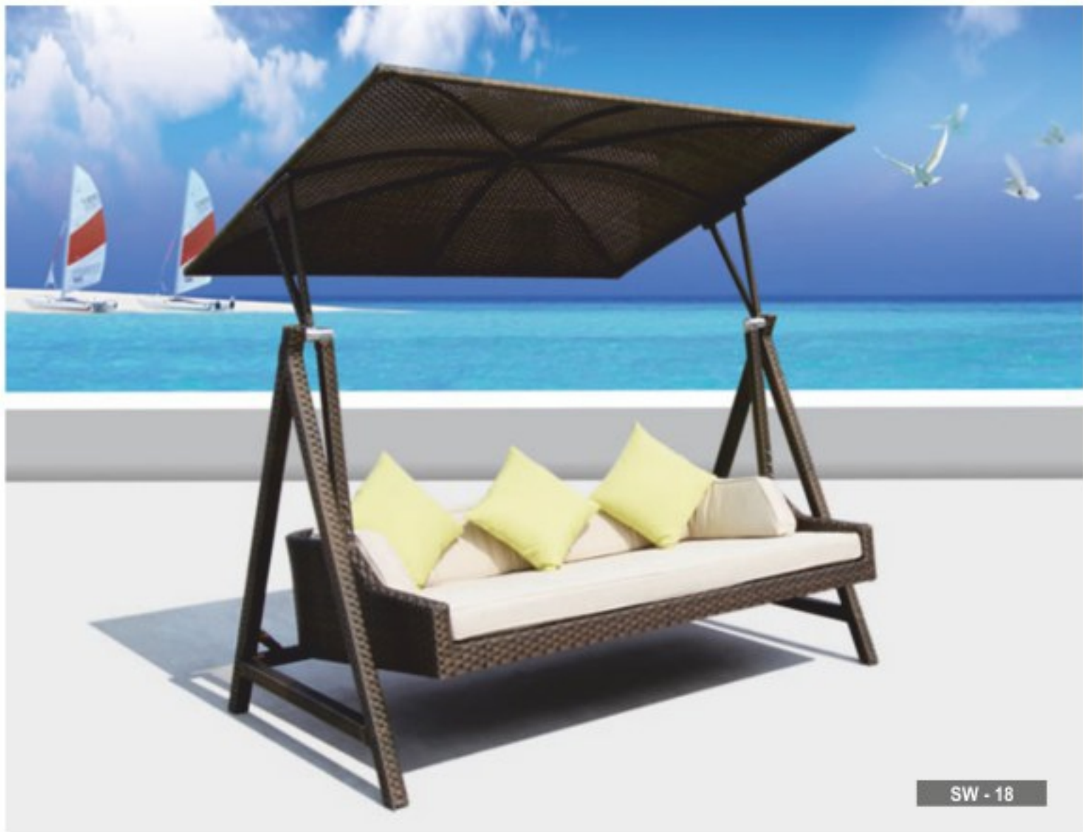
SW - 18