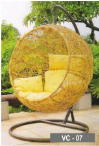
VC - 07