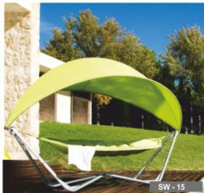
SW - 15