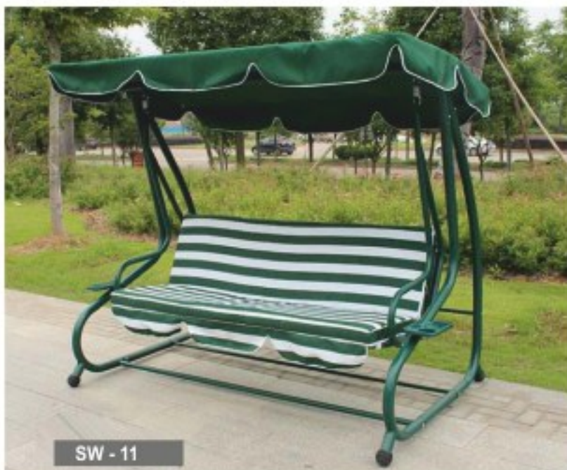
SW - 11