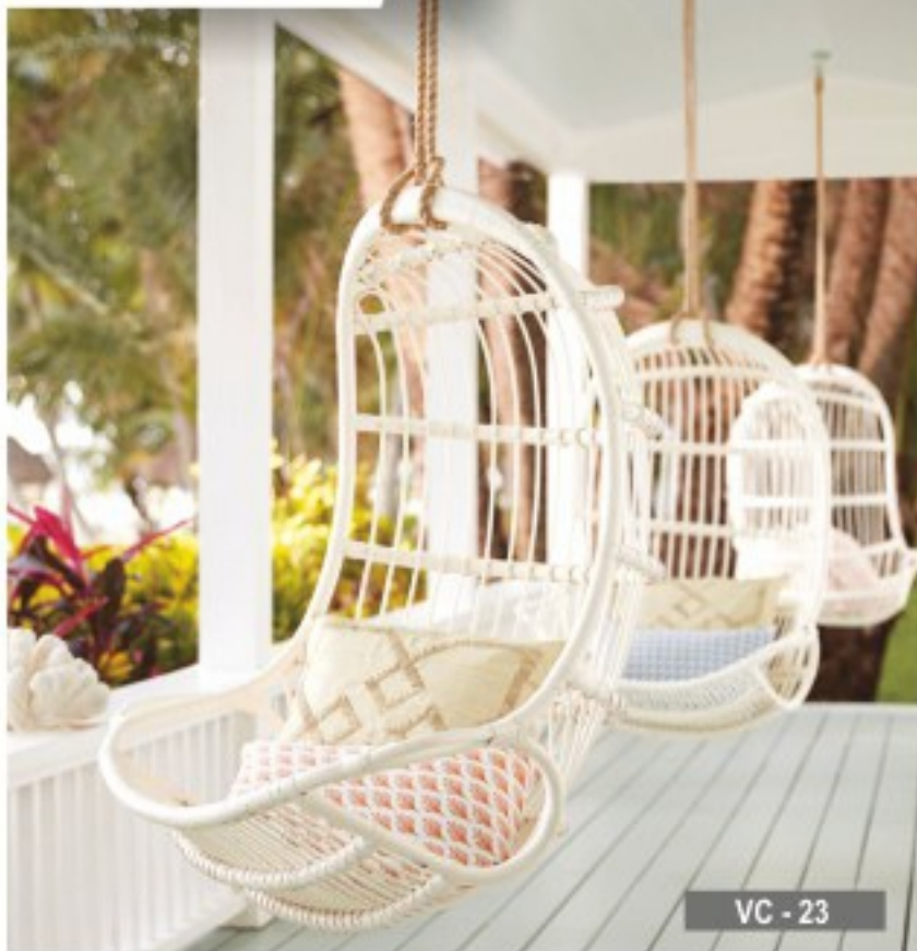
VC - 23