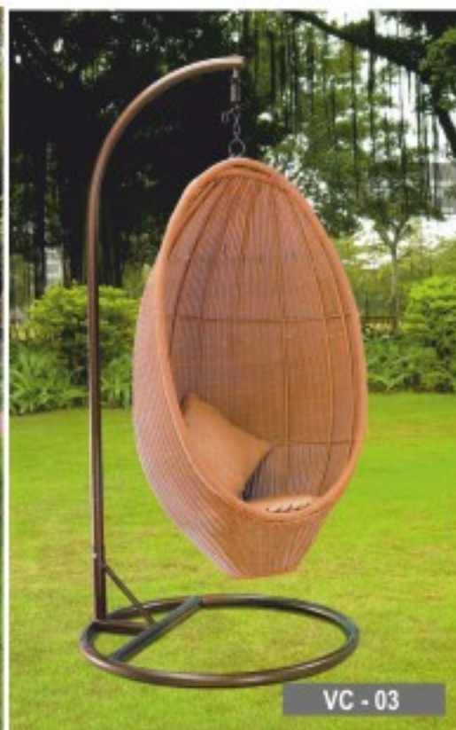
VC - 03