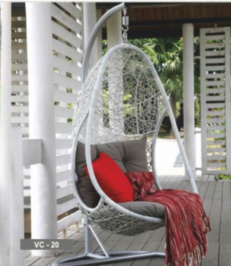
VC - 20