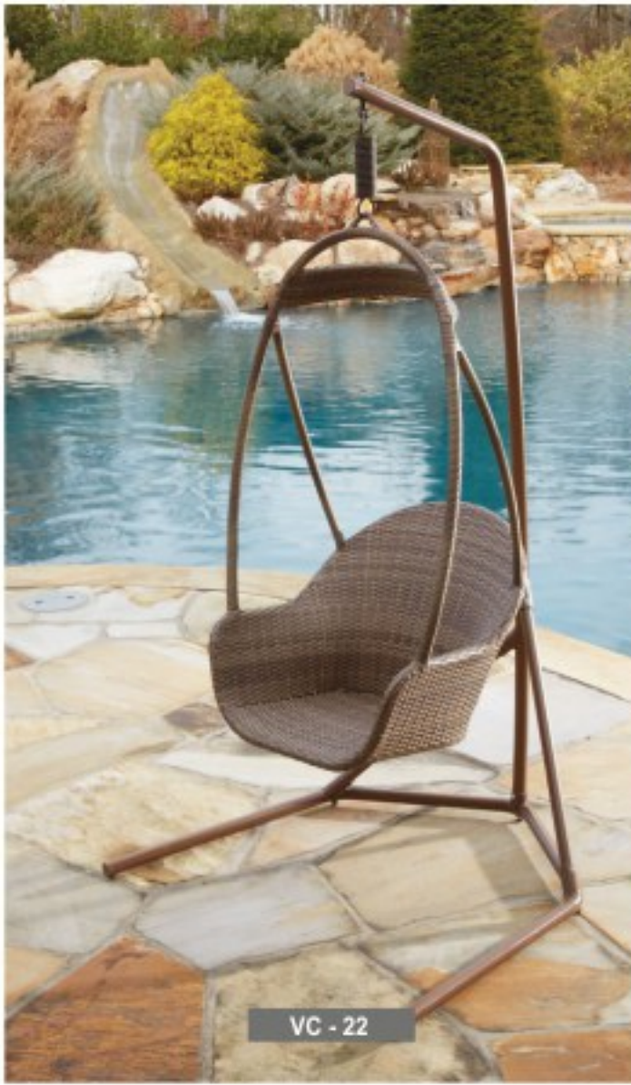
VC - 22