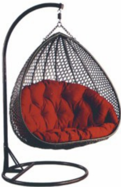
VC - 13