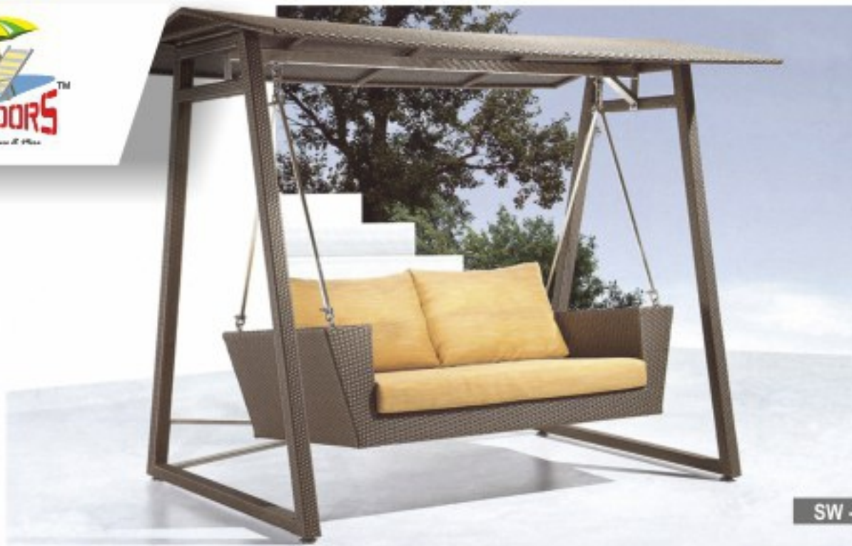
SW - 13