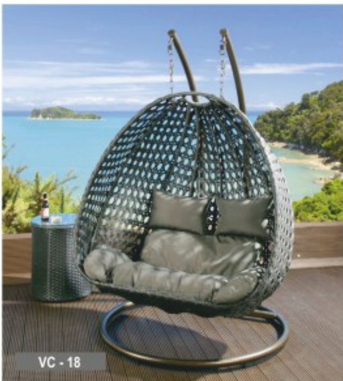
VC - 18