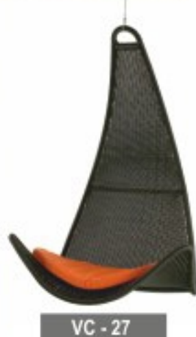
VC - 27