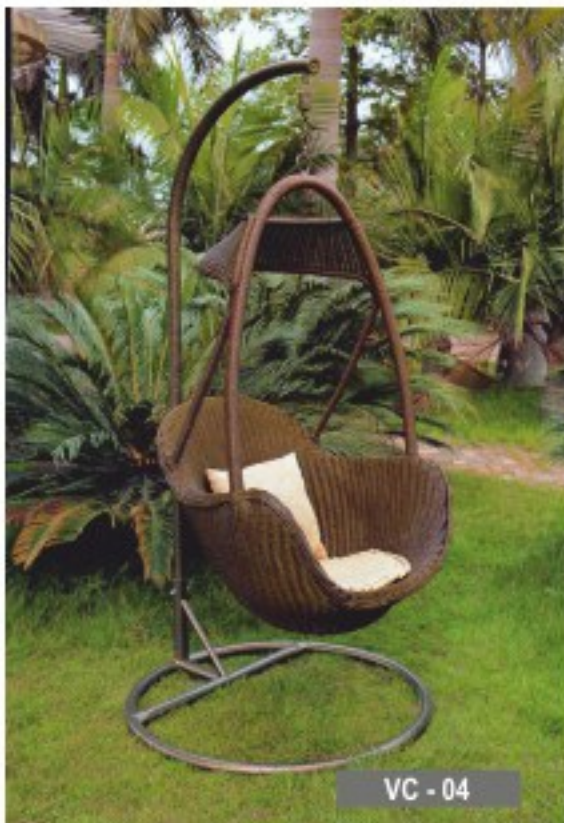
VC - 04