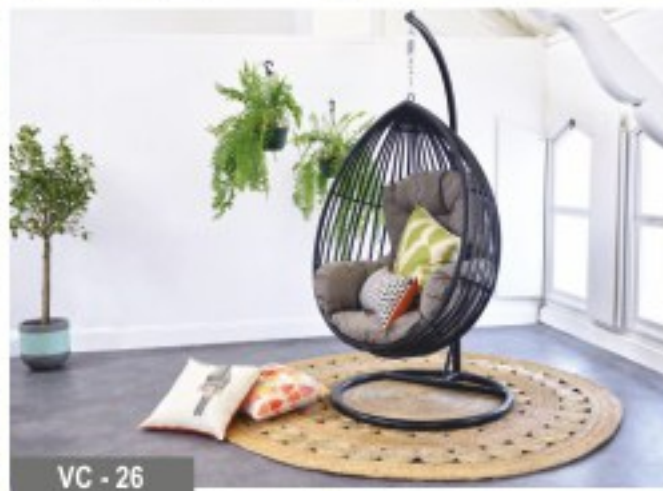
VC - 26