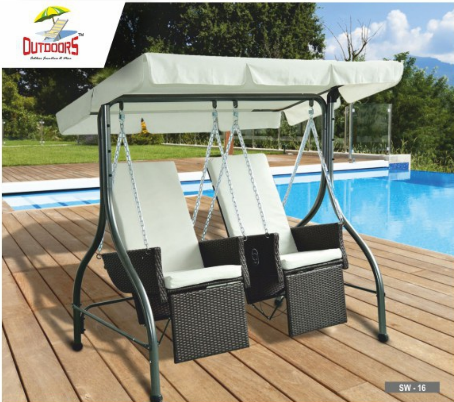
SW - 16