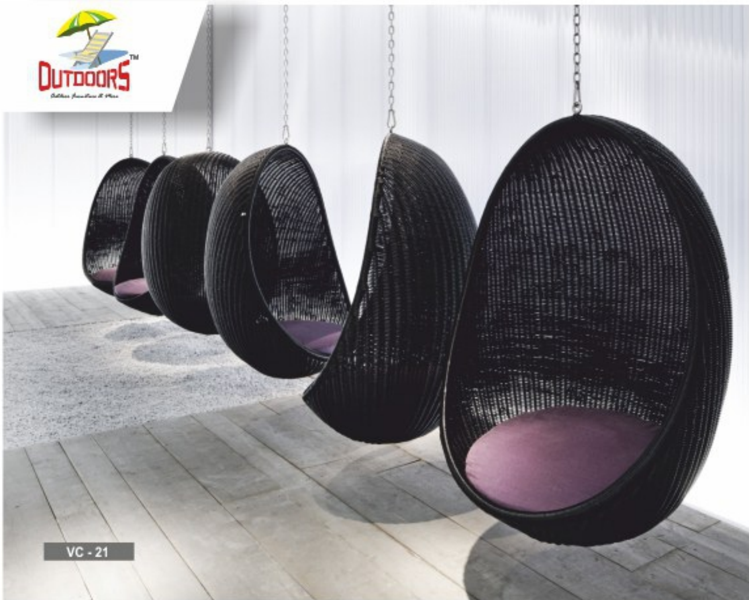
VC - 21