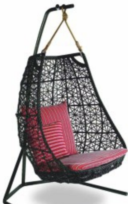
VC - 16