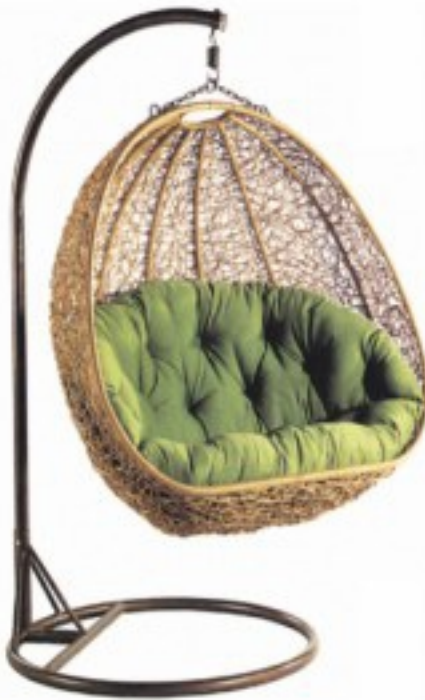
VC - 10