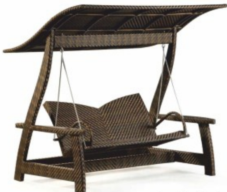
SW - 17