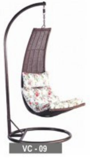
VC - 09