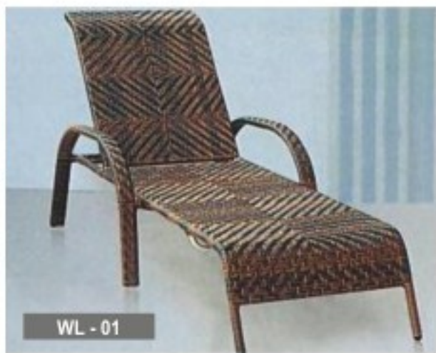
WL - 01