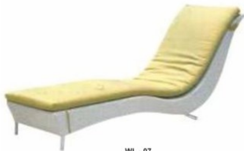
WL - 07