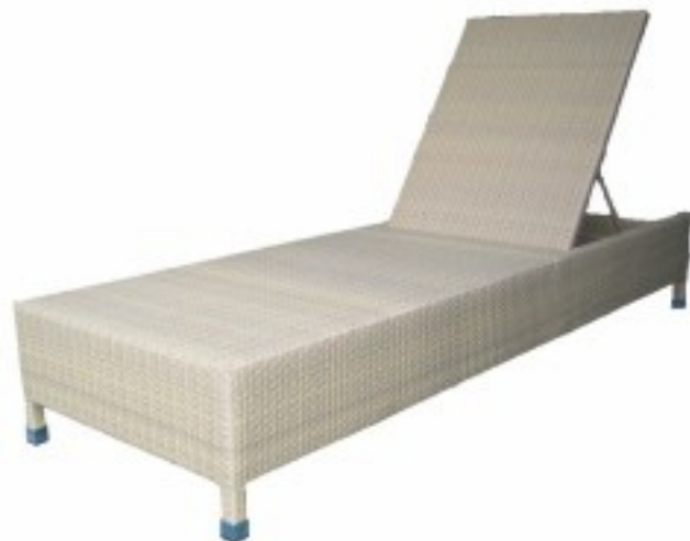
MPOL - 30