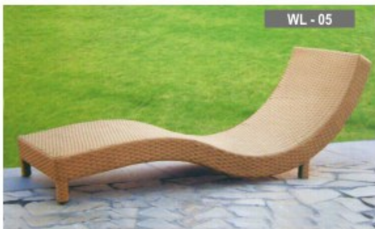
WL - 05