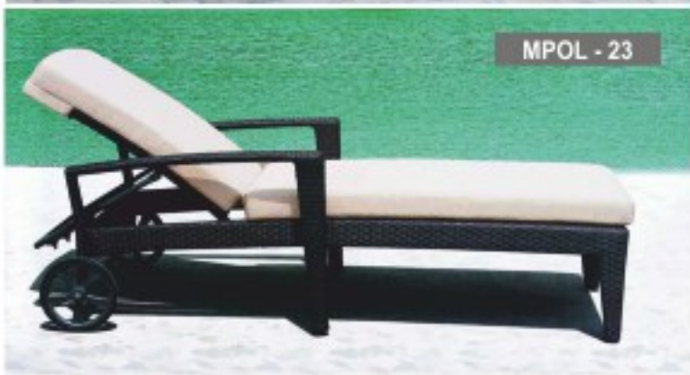
MPOL - 23