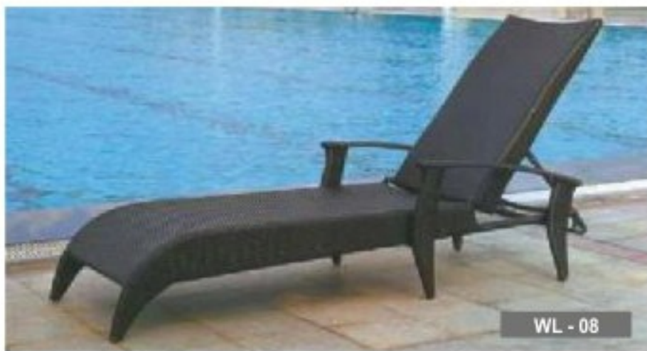
WL - 08