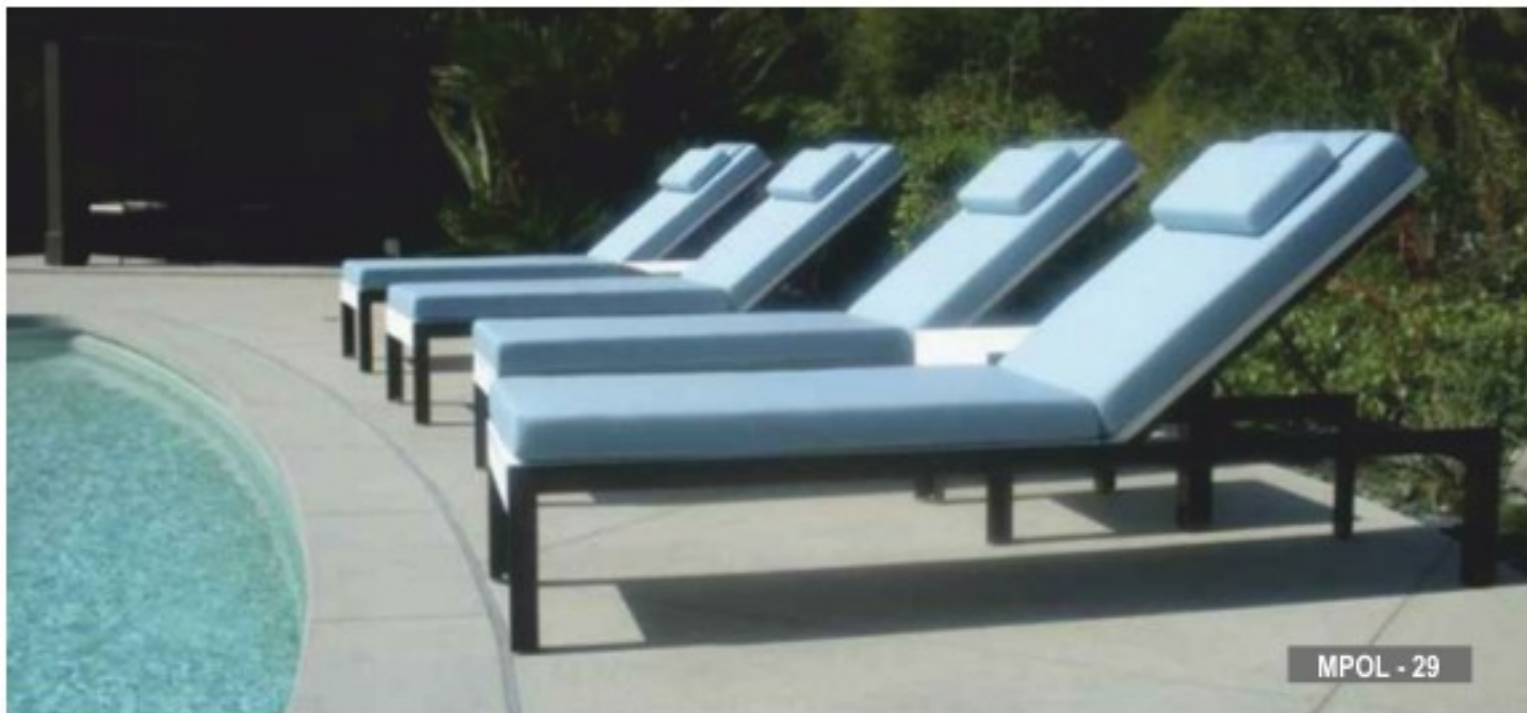
MPOL - 29