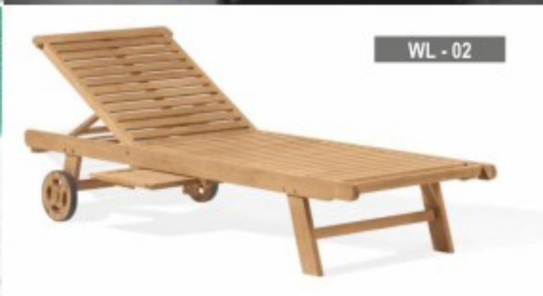
WL - 02