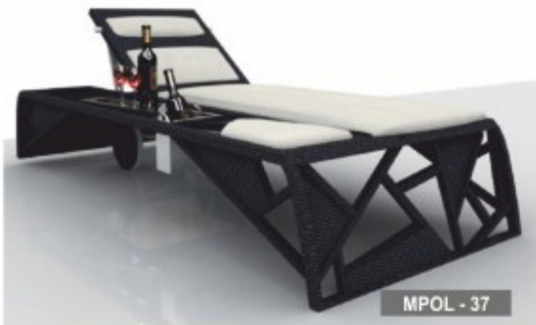
MPOL - 37