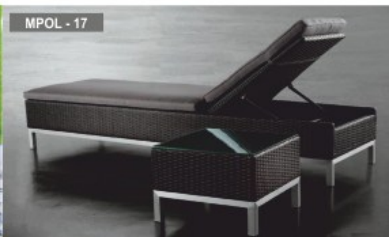
MPOL - 17