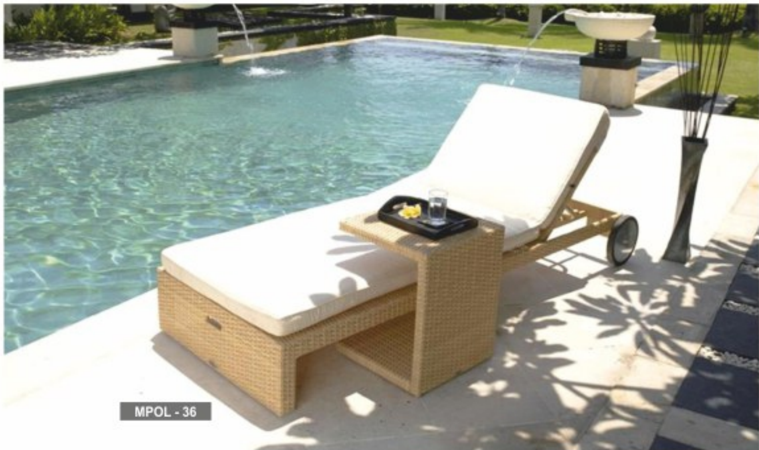
MPOL - 36