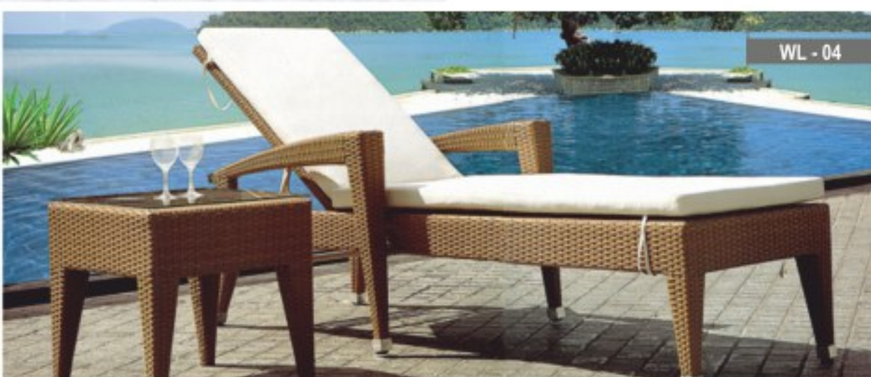
WL - 04