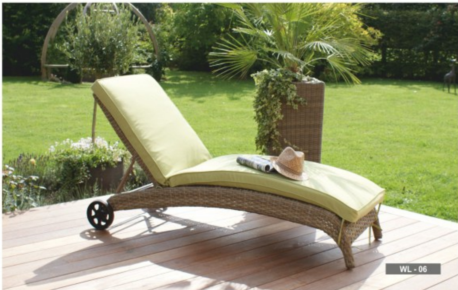
WL - 06