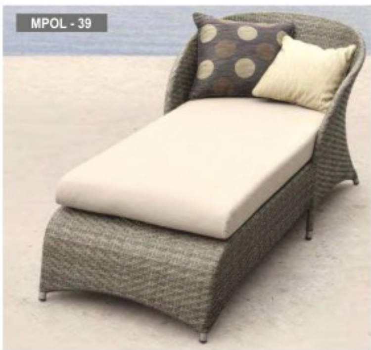
MPOL - 39