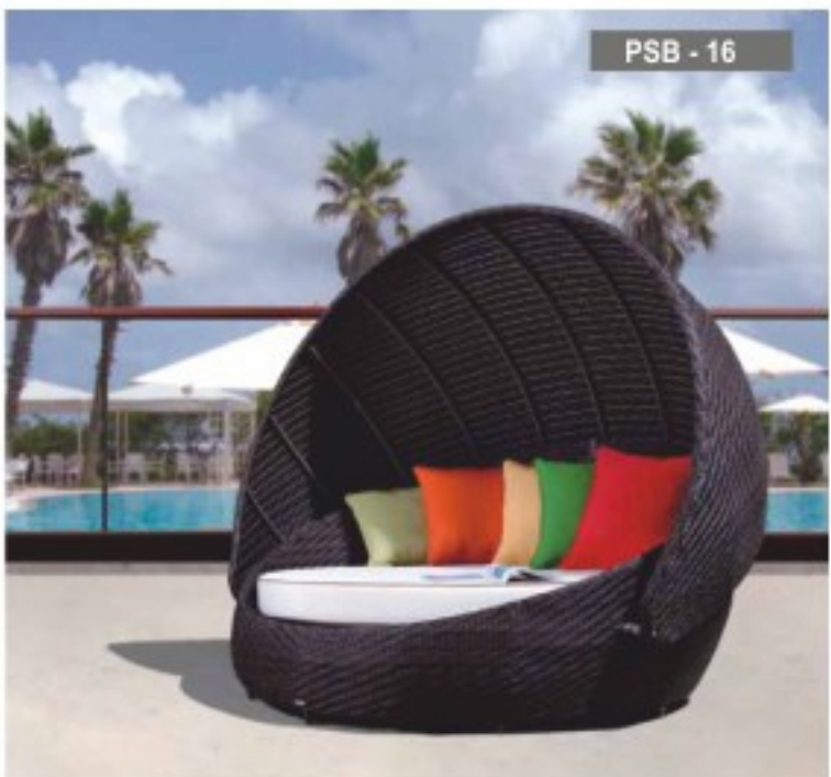
PSB - 16