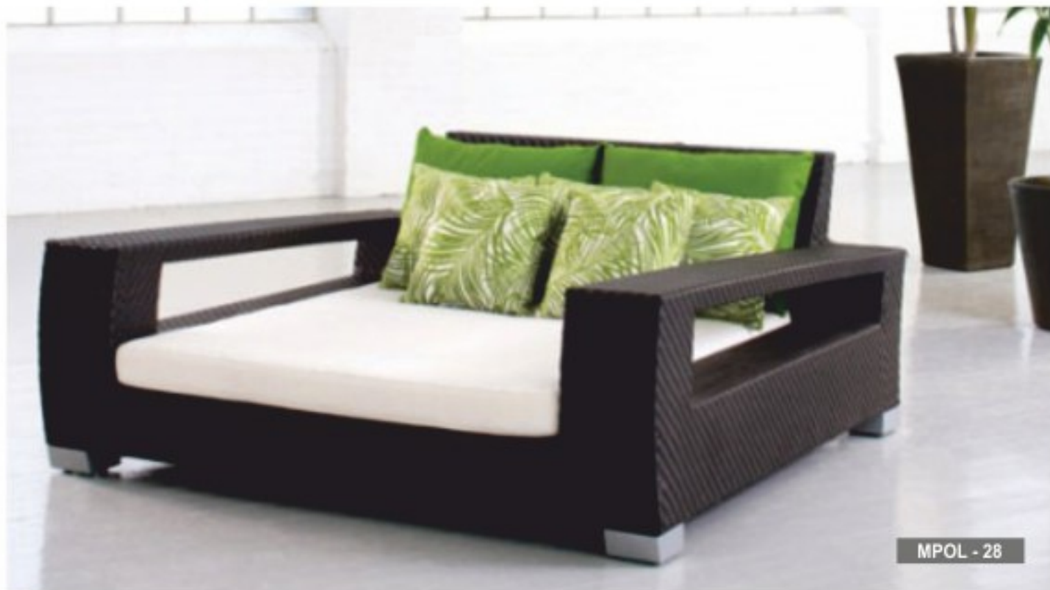
MPOL - 28