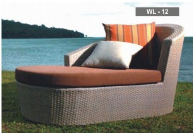
WL - 12