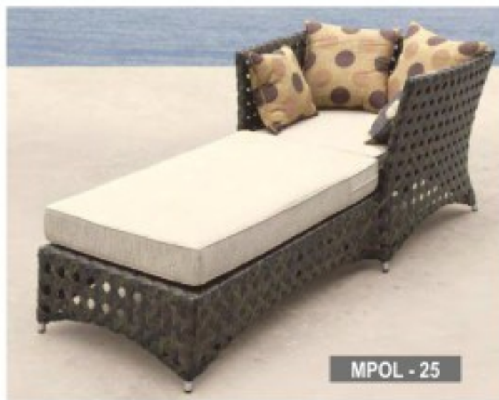
MPOL - 25