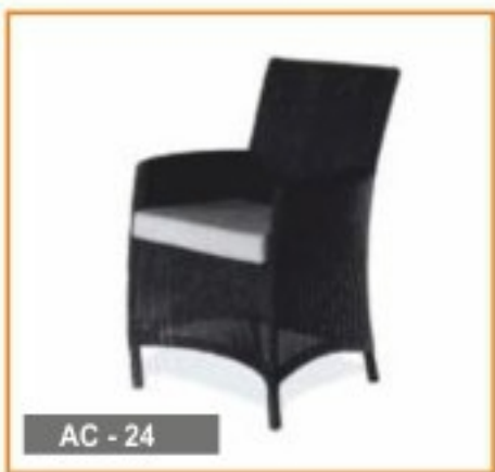
AC - 24