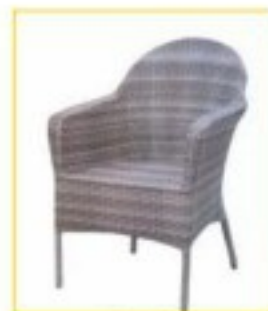
D - 89