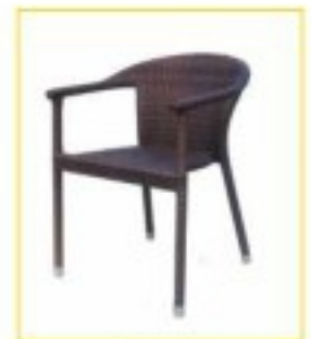
D - 92