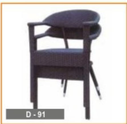
D - 91